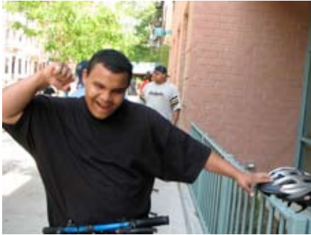
Ortiz-Wittenberg youth (pictured above and below) led a bike tour through East Harlem on Thursday, June 7th during “Rolling for Peace,” a