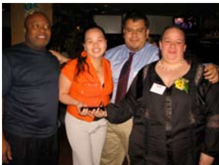
Property Management Personnel accept Staff of the Year award