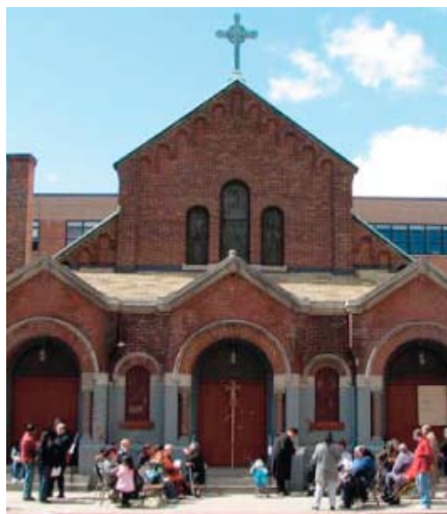
Our Lady Queen of Angels Roman Catholic Church